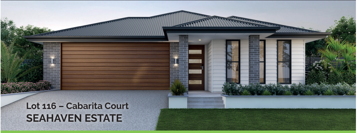
Lot 116 – Cabarita Court SEAHAVEN ESTATE